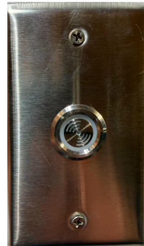
Inside Light / Alarm