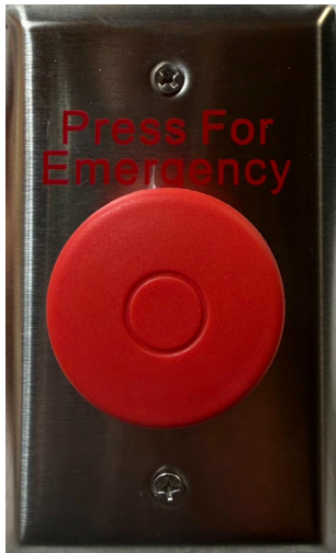
Emergency Call Button

Flush mounted — no surface-mounted backbox required. Wire as per the diagram in the Relay Master v6.5 manual. Class 2, Extra Low Voltage.